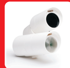
Additional Detector Pack