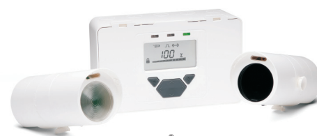
FIRERAY® 3000 System

The FIRERAY® 3000 End to End infrared Optical Beam Smoke Detector (OBSD) has been designed using the latest optical technology, incorporating modern industrial, electronic and software techniques. This detector offers cost effective protection of large, open area spaces with high ceilings. It is also very suited to applications where access to ceiling mounted smoke detectors presents practical difficulties.